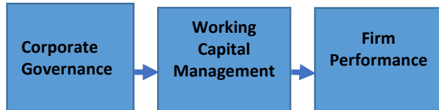
Figure 1: Research Model

H1: Working Capital Management significantly mediates the association between corporate governance and firm performance.